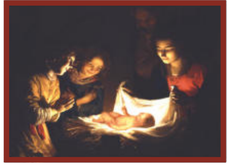
A savior has been born for you who is Christ and Lord.

All this took place to fulfill what the Lord had said through the prophet: Behold, the virgin shall conceive and bear a son,