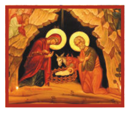
I proclaim to you good news of great joy.