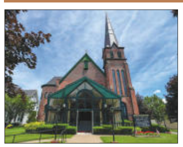
St. Michael Corner Phelps & Holley Sts. Lyons, NY 14489 Mass 4 pm, Saturday 8:30 am, Friday

August 15, 2021 The Assumption of the Blessed Virgin Mary