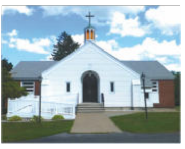
St. Mary Magdaleuc 15 Northup Avenue Wolcott, NY 14590 Mass 4:30 pm, Saturday 8:30 am, Monday & Friday

Sundays, 9:45 am - 10:15 am Wednesdays, 6:40 pm - 7:30 pm