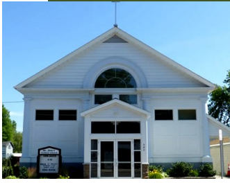
St. Jude 580 Main Street Fair Haven, NY 13156 Mass 8 am, Sunday (Summer)

Parish Offices: 43 W. DeZeng St., Clyde, NY 14433 315-902-4130