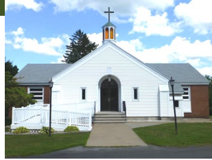
St. Mary Magdalene 15 Northup Avenue Wolcott, NY 14590 Mass 4:30 pm, Saturday 8:30 am, Monday & Friday