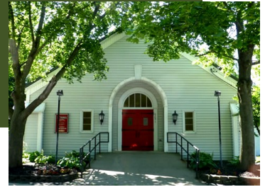
St. Thomas 6927 Main Street Red Creek, NY 13143 Mass 8 am, Sunday (Winter)

Hours: Monday - Thursday 8:00 am till 12:00 pm (Offices closed to public except by appointment due to COVID-19)