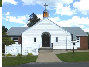
St. Mary Magdalene 15 Northup Avenue Wolcott, NY 14590 Mass 4:30 pm, Saturday 8:30 am, Monday & Friday