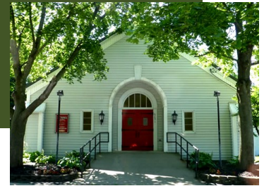
St. Thomas 6927 Main Street Red Creek, NY 13143 Mass 8 am, Sunday (Winter)

Parish Offices: 43 W. DeZeng St., Clyde, NY 14433 315-902-4130