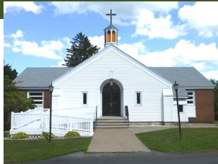
St. Mary Magdalene 15 Northup Avenue Wolcott, NY 14590 Mass 4:30 pm, Saturday 8:30 am, Monday & Friday