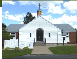
St. Mary Magdalene 15 Northup Avenue Wolcott, NY 14590 Mass 4:30 pm, Saturday 8:30 am, Monday & Friday